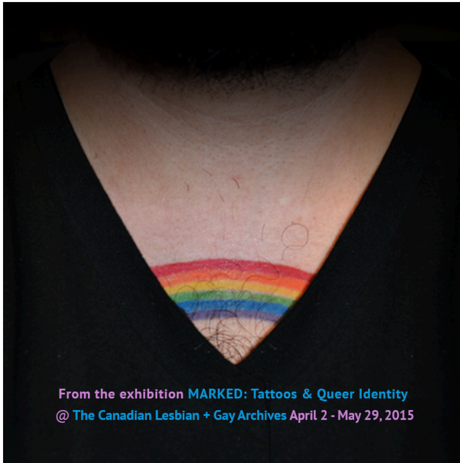
From the exhibition MARKED: Tattoos & Queer Identity @ The Canadian Lesbian + Gay Archives April 2 - May 29, 2015

Before this discovery, young Israelis have been tattooed on the forearm the deportation number of grandparents. They created by this act intense debates.