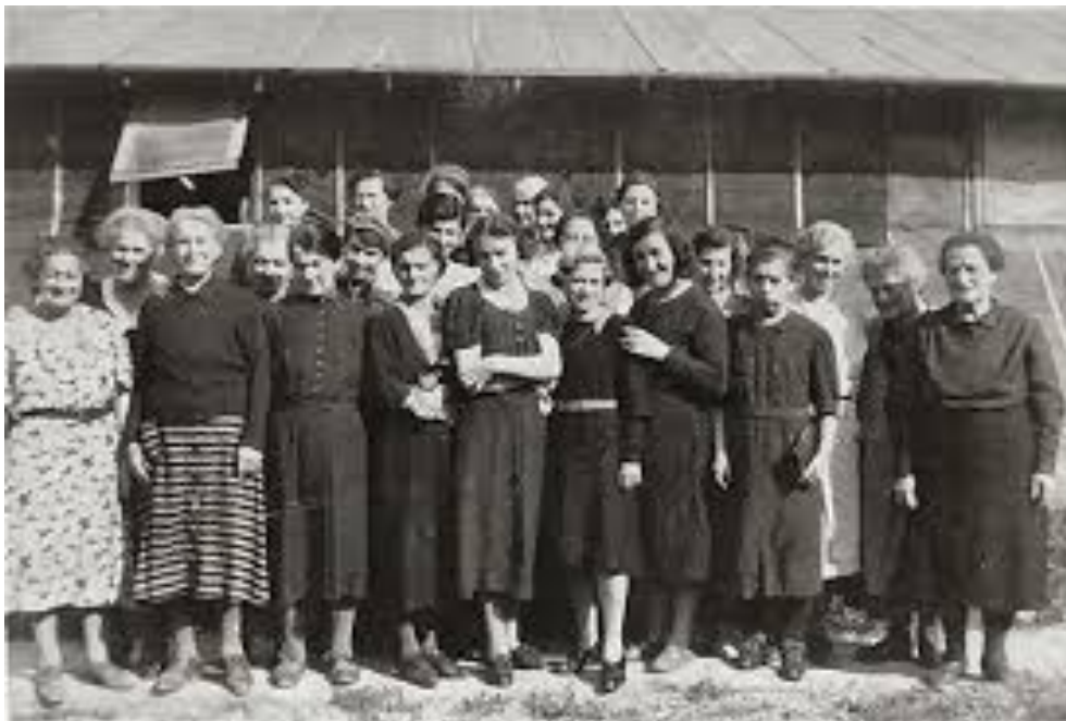
Camp d'internement de Gurs, France

Make visible plural forms of resistance, without prioritization help to deconstruct the hierarchies established by heterosexism that governs our Western societies. That enrich our individual and collective imaginary world to resist today and tomorrow, here and elsewhere.