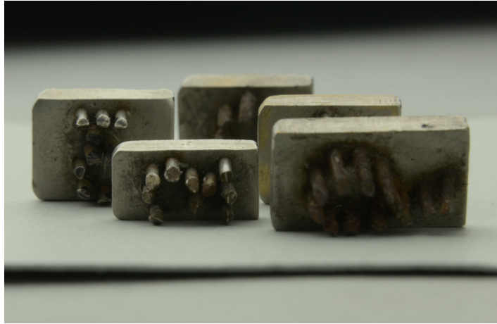
Plaques en métal, aiguilles, Auschwitz, Birkenau, 2014

At the same time, there was also the discovery of five rare original metal plates of needle. Those needles were used by Nazis to tattoo prisoners. These plates were returned to the death camp of Auschwitz-Birkenau Museum in two thousand fourteen.