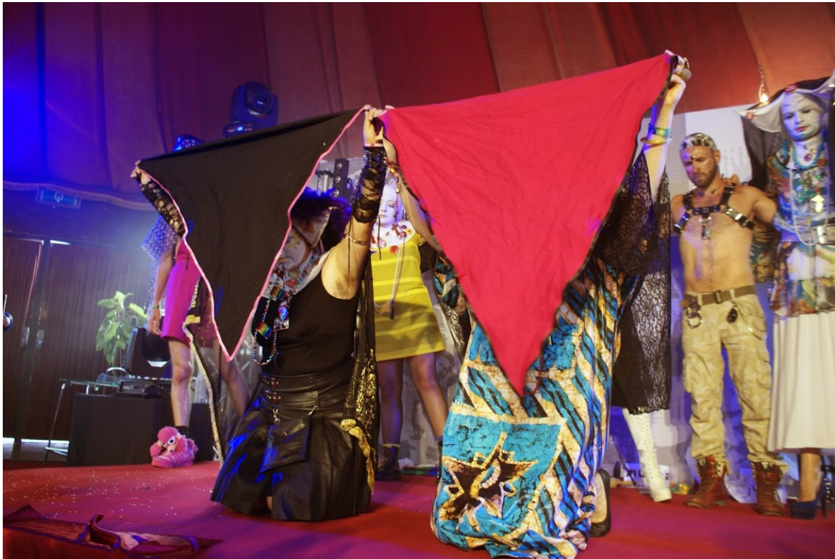
Solidays, Paris, 2012

After wearing T-shirts and badges of Act Up Lille and Act Up Paris, with their inverted pink triangles referring to the pink triangle of deported gays, after painting a pink triangle and a black triangle on my face of sister of perpetual indulgence, I decided to turn around the barbaric act of identification that are the tattoos made by the Nazis on the deportees.