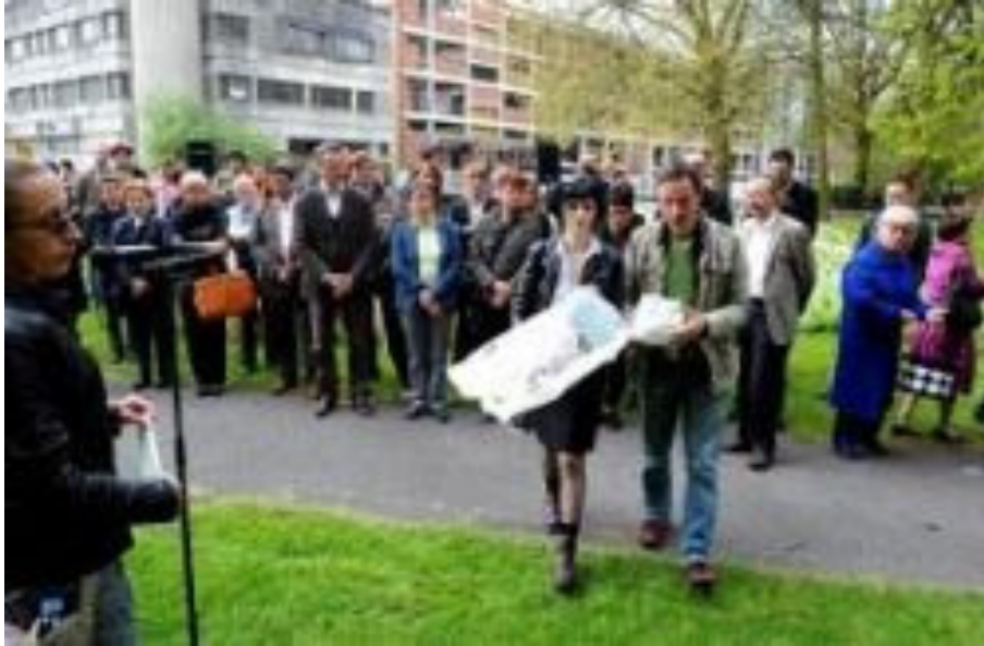
Lille, Journée du Souvenir de la Déportation, 2010

At a time when millions of persons, including LGBTQI people, are escaping from tyrannical regimes and wars, and climate change .... While hundreds of thousands of people are in camps at the borders of Europe, others in front of the British coast ... question and share the story of people who were interned in camps set up around the world especially in Europe during World War Two seems essential.